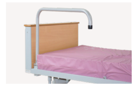
CM-ACC11 (left) / CM-ACC12 (right)